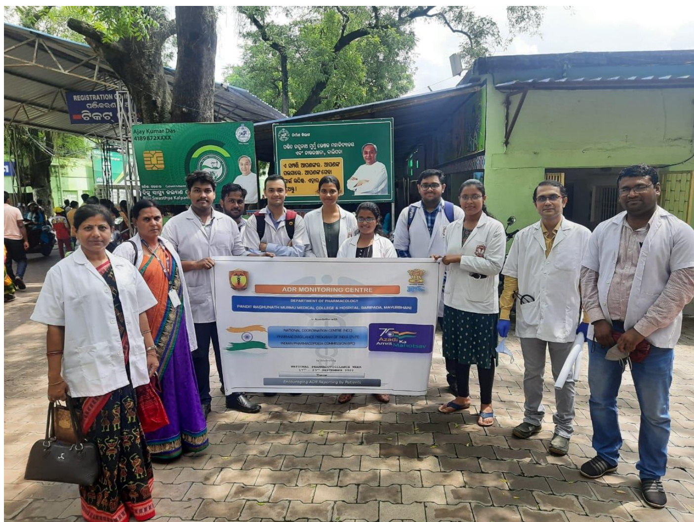
(Glimpse of 2 nd Pharmacovigilance Week/2022, celebration. 17 th – 23 rd September 2022)